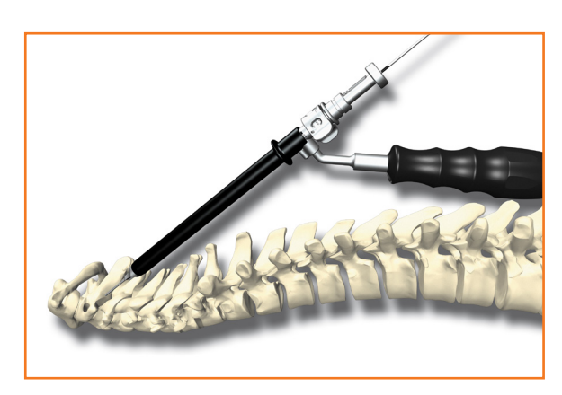
MIS C1-C2 transarticular procedure option available