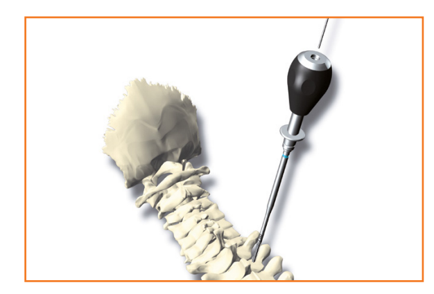
Cannulated screws available for placement and postitioning of screws