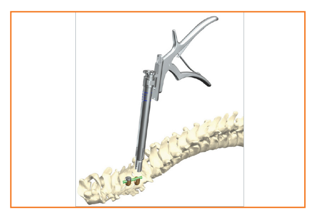
Gun-style reducer available